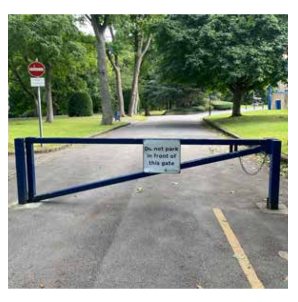
A blue barrier with a sign on it, that leads to the back of Cartwright Hall.