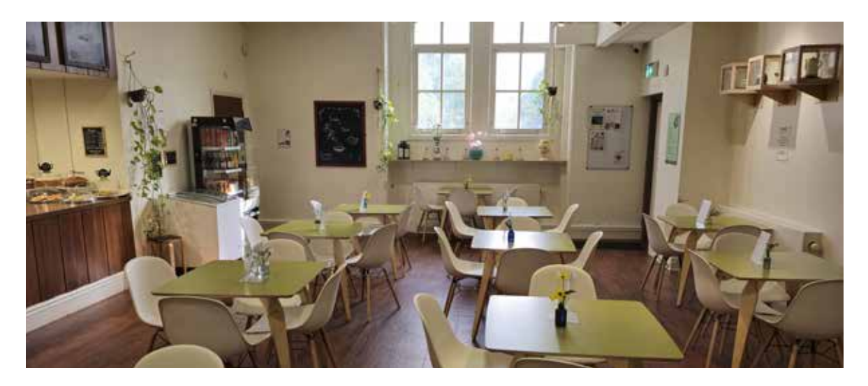
The café, with tables and chairs.

The café can be accessed by the door at the side of the building, a short walk from the disabled parking spaces or if you are ok with stairs, it can be accessed from inside the gallery.