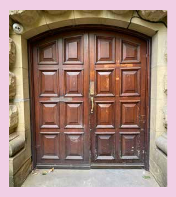
Accessible entrance with large wooden doors.

There is a red doorbell, please press that and a visitor assistant will let you into the building. This can take a couple of minutes if we are very busy.