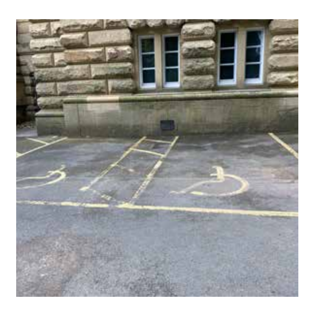
Disabled parking spaces.

Call 01274 431212 on arriving at the barrier and a member of visitor services will open the barrier for you. Please follow the road down towards the gallery and you will see the disabled parking spaces.