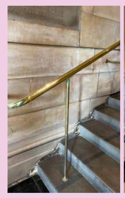
The stone stairs have brass handrails on both sides.

We have stairs inside the gallery to take you to the café and the first floor. The stairs have handrails to help you use them.