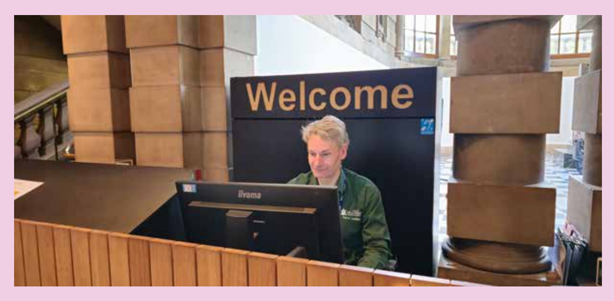
A visitor assistant at the reception desk.

All museum and gallery staff wear a blue lanyard. If you have any questions or require assistance, please speak to a visitor assistant. At reception they can provide a map to orientate you into the galleries.