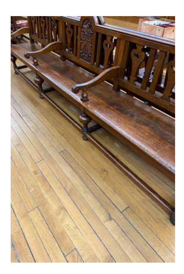
Wooden bench with back and arms.

We have benches in the gallery and portable foldable chairs.