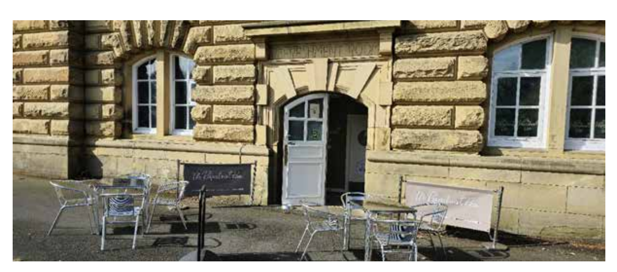
Accessible entrance to the cafe.

Go through the blue gates and past the café on your left.