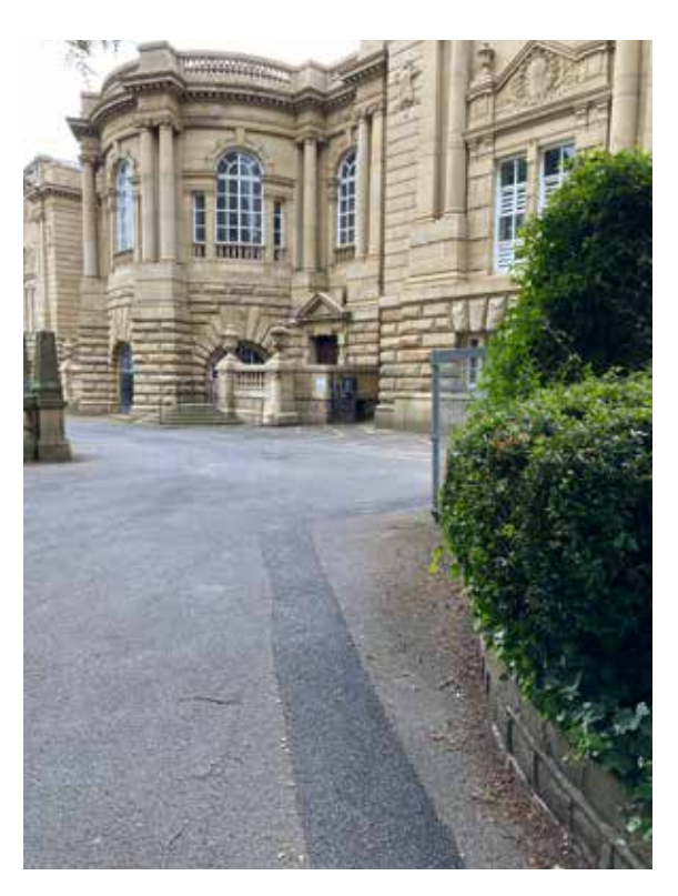
The back of Cartwright Hall and the route to the accessible entrance.