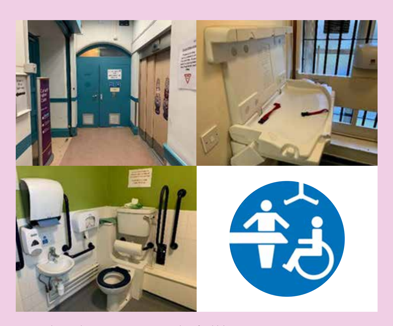
Accessible toilets and baby changing facilities.

We have gender neutral accessible toilets on the ground floor and in all the café toilets. We have male and female toilets on the ground floor. Baby changing facilities can be found in the accessible toilets on the ground floor and in the café.