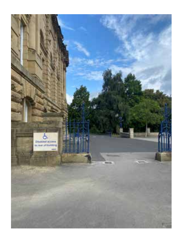
The stone building of Cartwright Hall showing the route to the accessible entrance.

Go through the blue gates and past the café on your left.