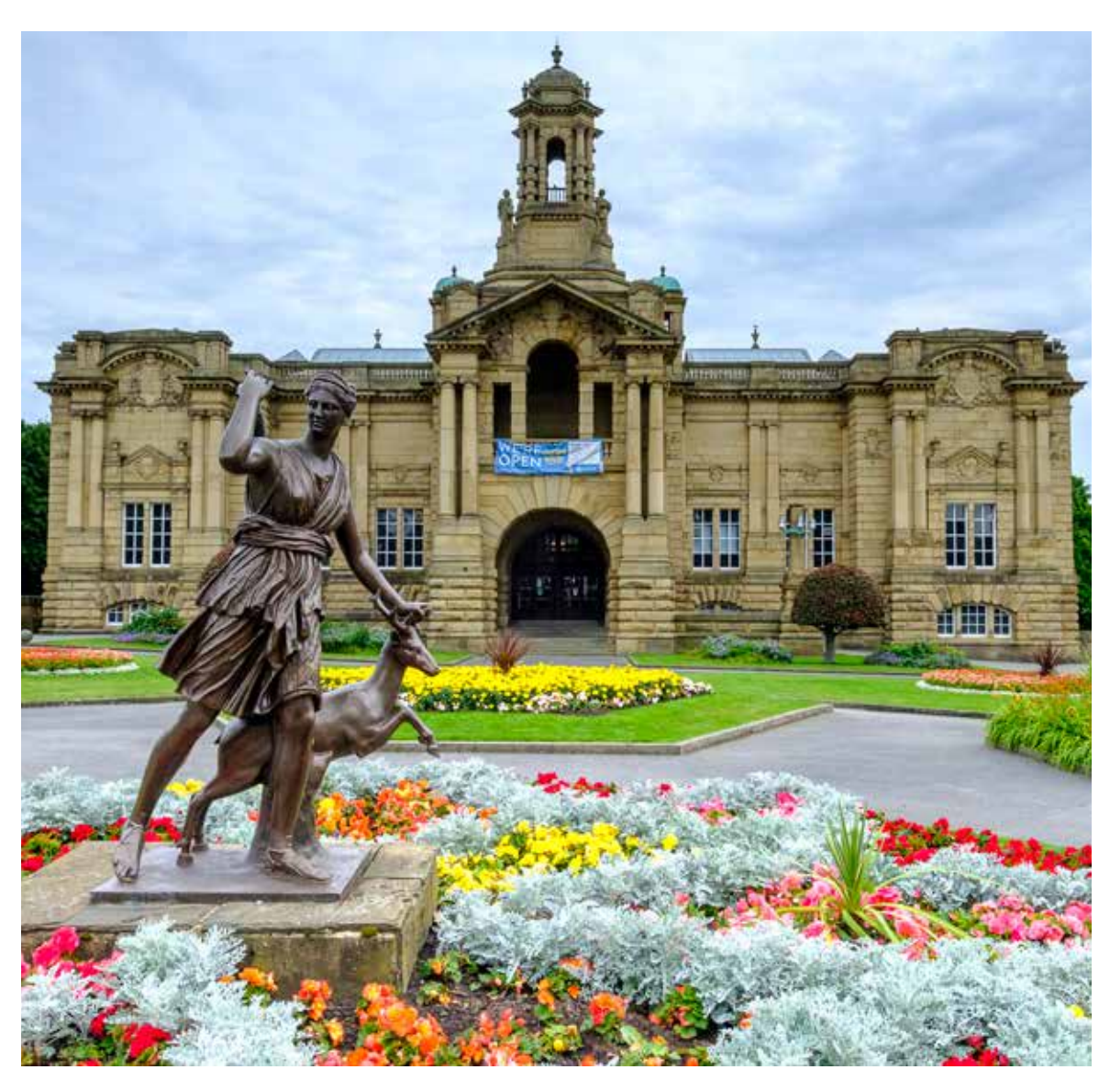
A sculpture of Diana the Huntress within a colourful flowerbed, with Cartwright Hall behind

Cartwright Hall was opened in 1904, as an art gallery. People sometimes think it is an old house, but nobody has ever lived here! Cartwright Hall can be found in the centre of beautiful Lister Park, which has won several national awards.