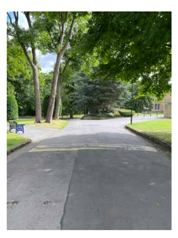
Route down to gallery from the blue barrier.