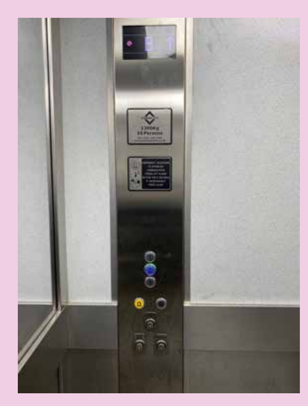
Inside the lift.

We have stairs inside the gallery to take you to the café and the first floor. The stairs have handrails to help you use them.