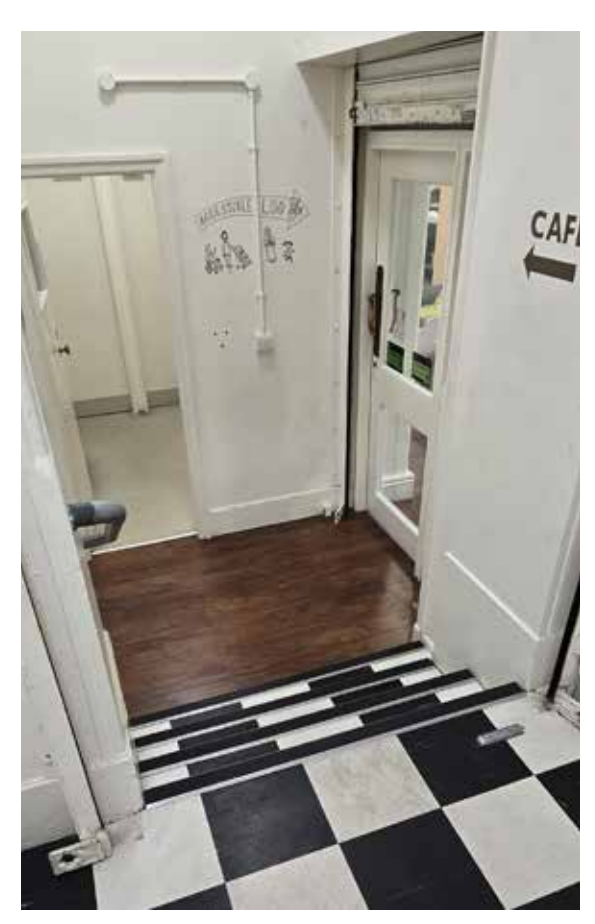
Hallway leading into the café.