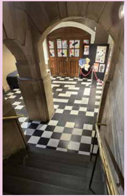
Stairs leading to café entrance.