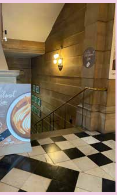
Stairs to go down to the café. There is also a step free route.