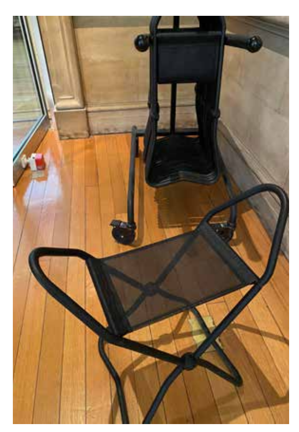
Foldable chairs with arms but no back.