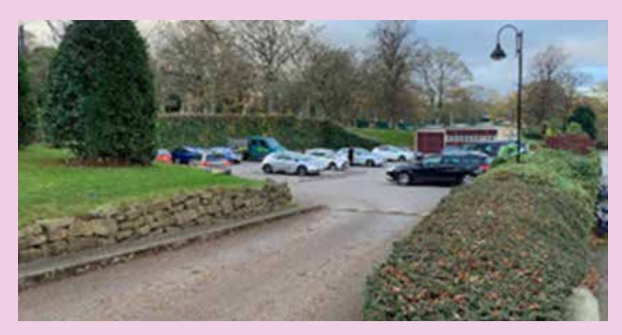
The car park within Lister Park.

Cartwright Hall's closest railway station is Frizinghall but the walk from the station is quite steep.