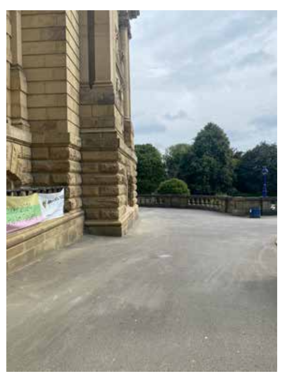
The stone building of Cartwright Hall with blue gate and trees.