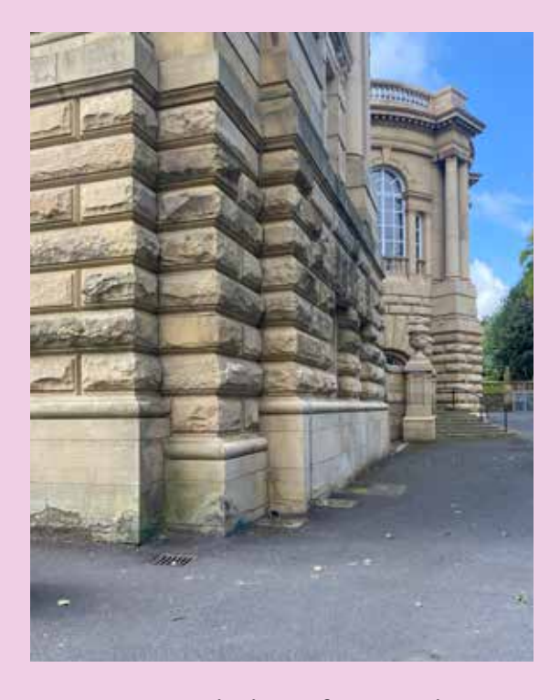
The stone building of Cartwright Hall, continue following the building around to the large wooden double doors.

The large wooden doors of the accessible entrance, behind a black gate.