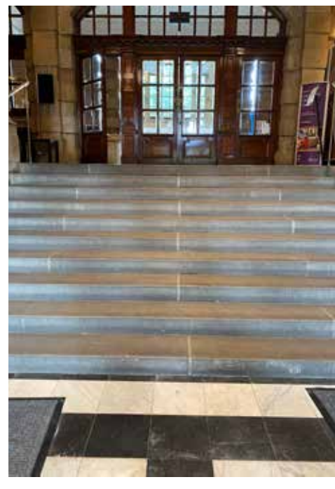
Stairs in the entrance foyer.

Lockers, free to use, large enough for a backpack.