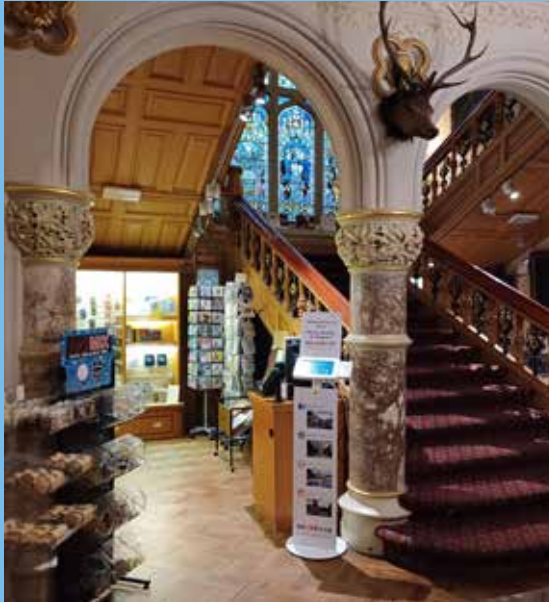
The Museum Shop is located near to the main entrance on your left.

Assistance dogs are welcome but we ask that they are kept on a lead or harness throughout their visit. Visitor Assistants will check with you if the dog is an assistance dog.