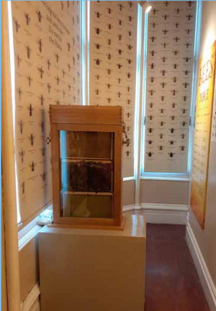
Beehive (summer months only)