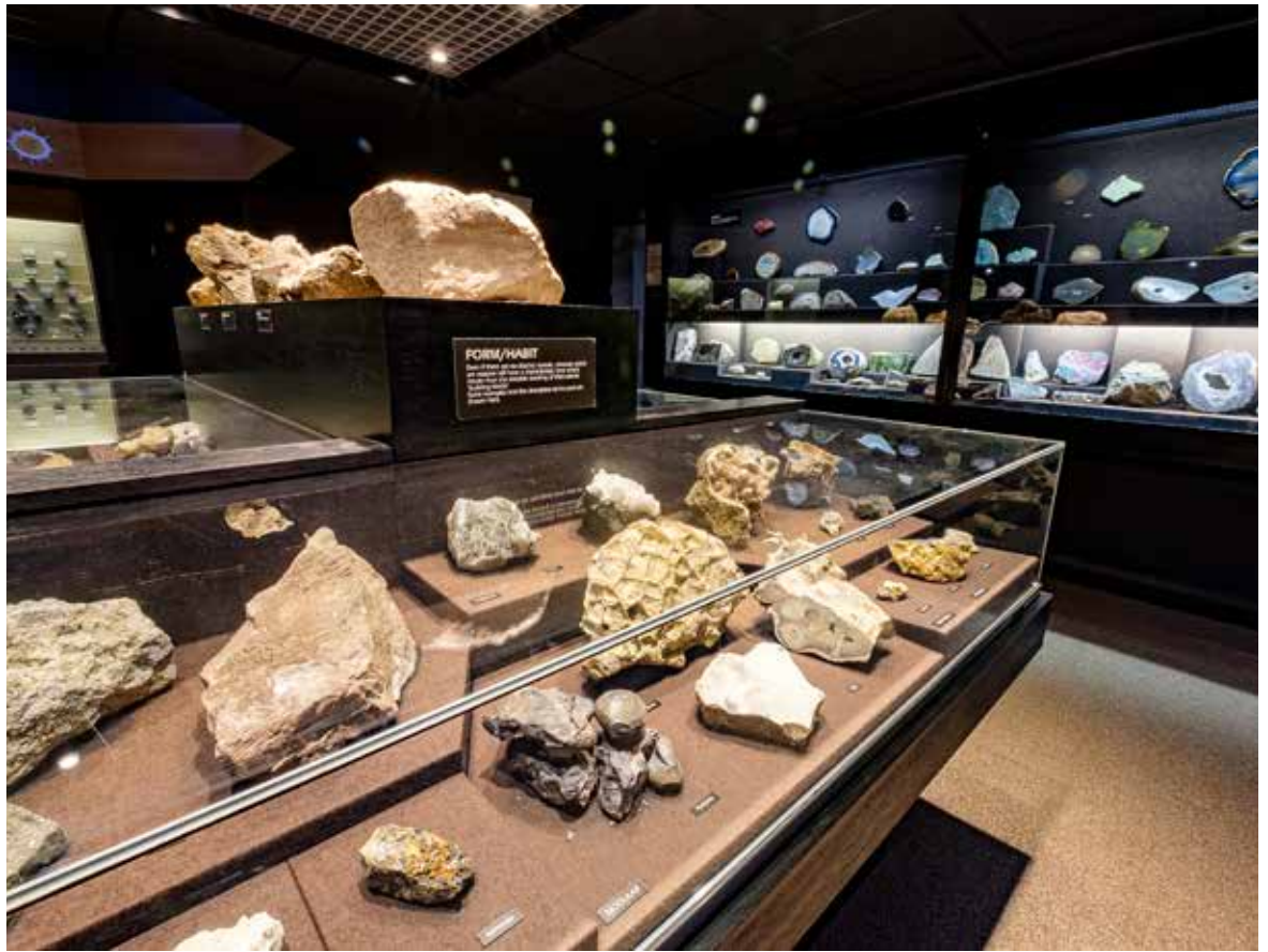
Molecules to Minerals