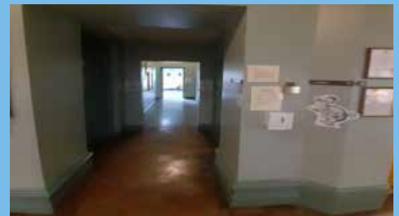
The end of the corridor showing the Gents Toilets and the Accessible Toilet and Baby Change (to the right of the photo)