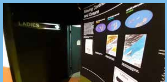
The Ladies Toilets are further down the corridor, to the left in the Airedale Gallery.