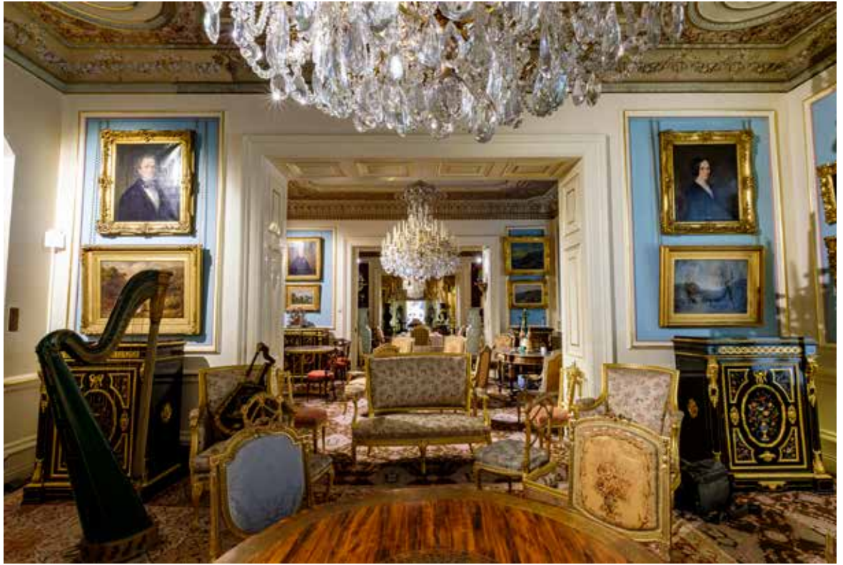
The history of Cliffe Castle

On the Ground Floor, you will find galleries about