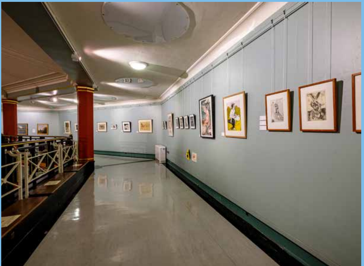
Bracewell Smith Hall Balcony with changing exhibitions