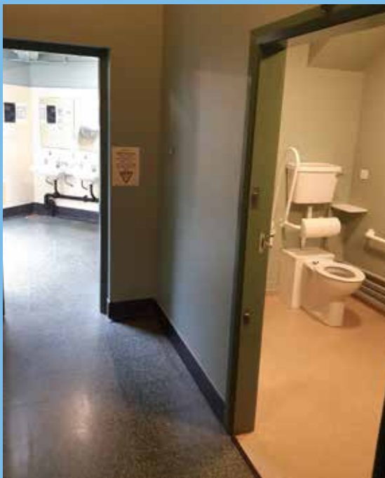
Further down the main hallway, you will find Gents Toilets and the Accessible Toilet down a short corridor on the left. The Accessible Toilet is gender neutral and also has baby changing facilities.