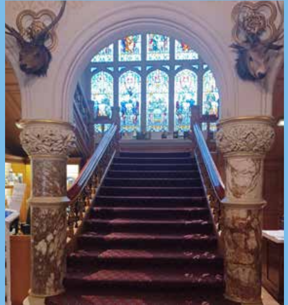
There is a staircase to reach the first floor of the museum. We're sorry, but there is no lift.