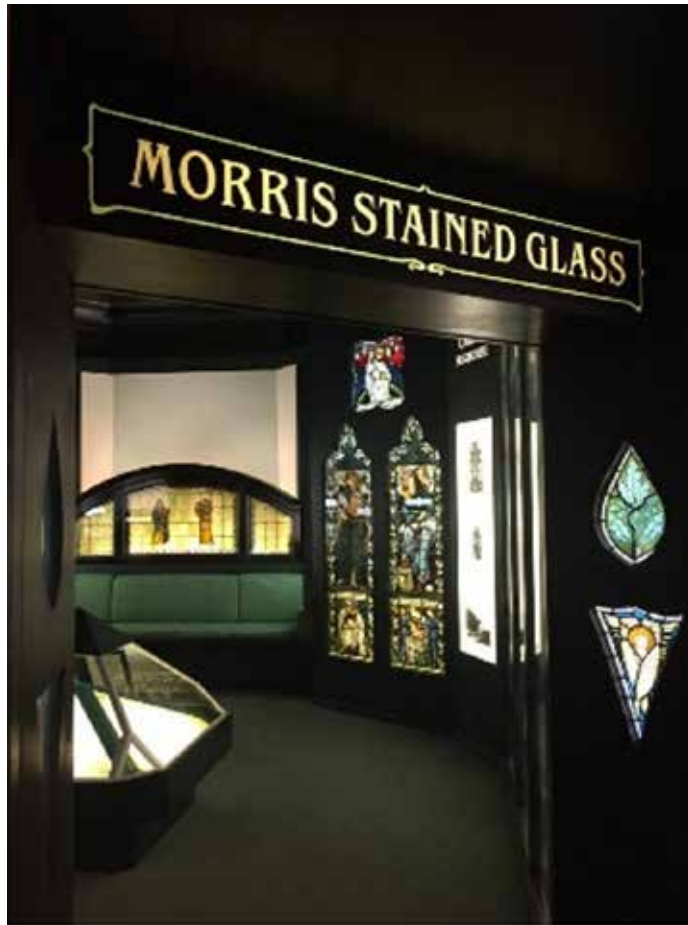
William Morris Stained Glass

On the First Floor, you will find galleries about