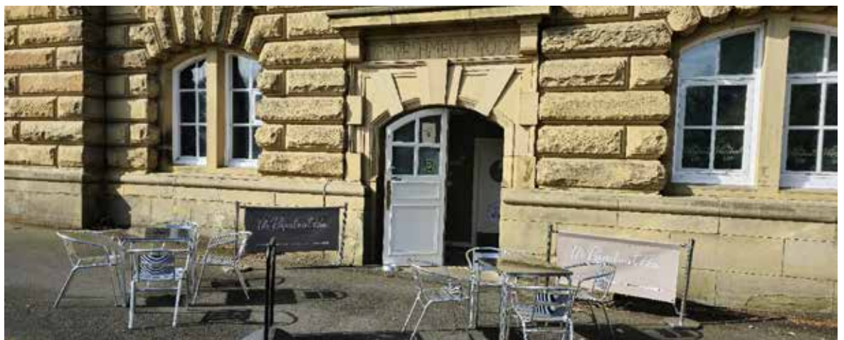
Accessible entrance to the café.

Go through the blue gates and past the café on your left.