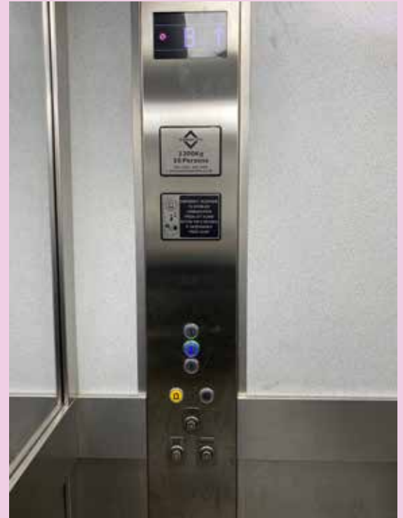
Inside the lift.

We have stairs inside the gallery to take you to the cafe and the first floor. The stairs have handrails to help you use them.