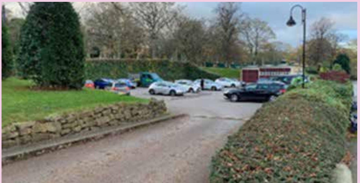
The car park within Lister Park.

Cartwright Hall's closest railway station is Frizinghall but the walk from the station is quite steep.