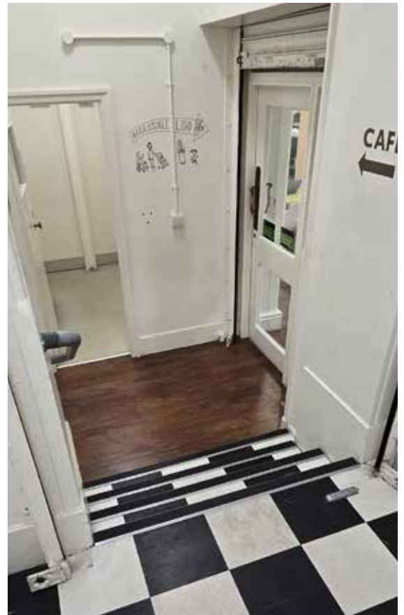
Hallway leading into the café.