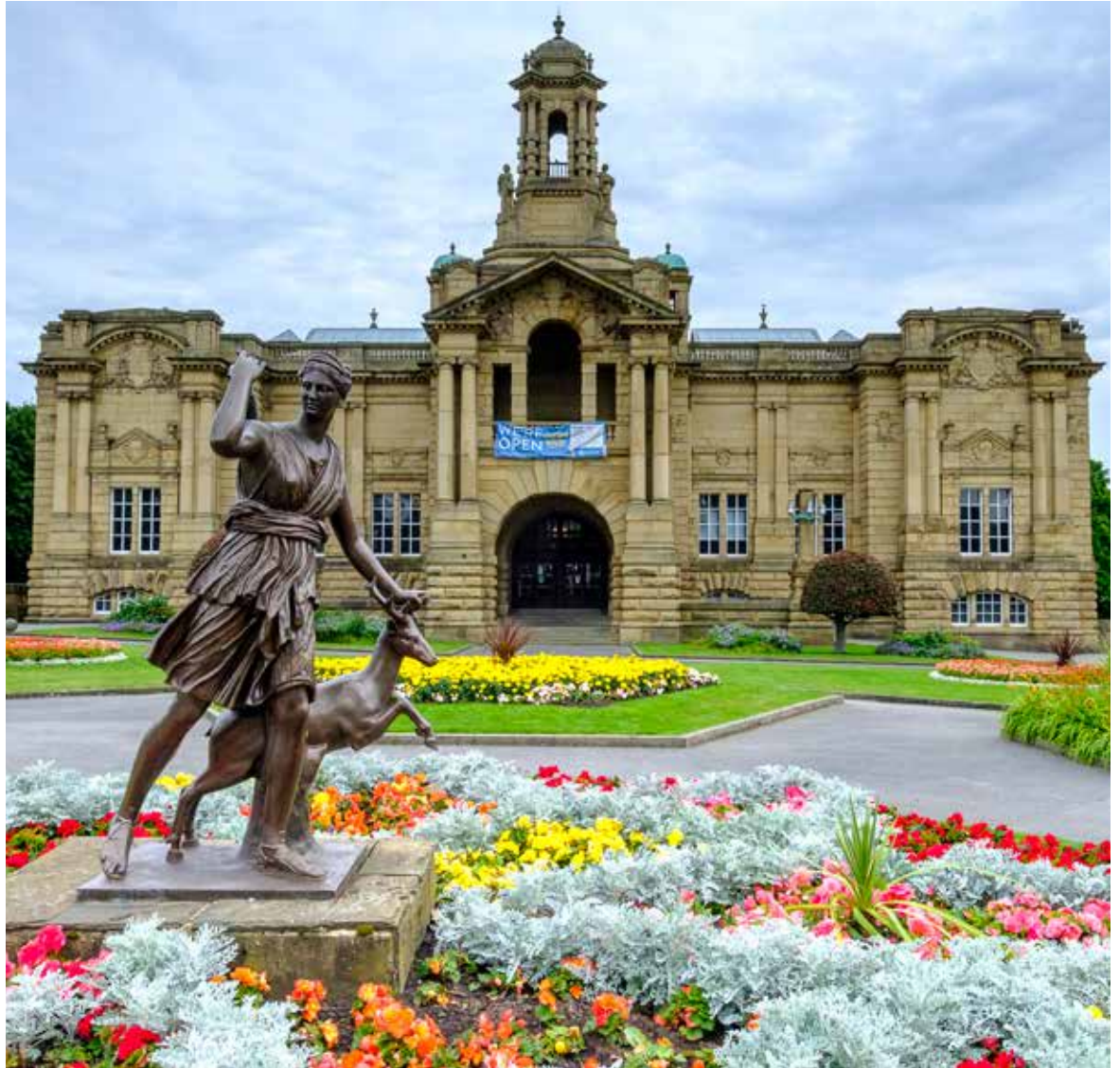
A sculpture of Diana the Huntress within a colourful flowerbed, with Cartwright Hall behind

Cartwright Hall was opened in 1904, as an art gallery. People sometimes think it is an old house, but nobody has ever lived here! Cartwright Hall can be found in the centre of beautiful Lister Park, which has won several national awards.