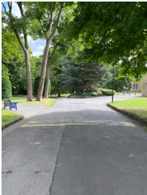
Route down to gallery from the blue barrier.