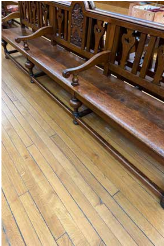
Wooden bench with back and arms.

We have benches in the gallery and portable foldable chairs.