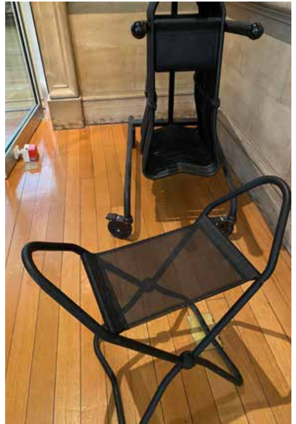
Foldable chairs with arms but no back.