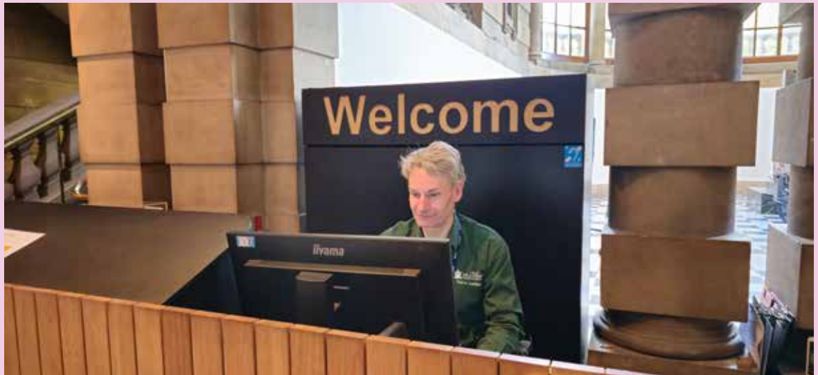
A visitor assistant at the reception desk.

All museum and gallery staff wear a blue lanyard. If you have any questions or require assistance, please speak to a visitor assistant. At reception they can provide a map to orientate you into the galleries.