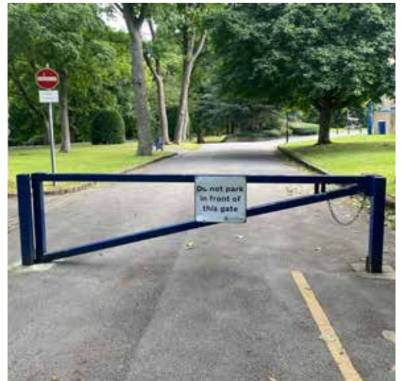
A blue barrier with a sign on it, that leads to the back of Cartwright Hall.