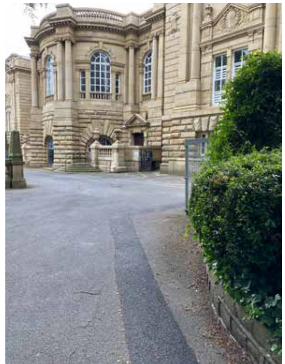
The back of Cartwright Hall and the route to the accessible entrance.