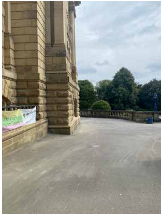
The stone building of Cartwright Hall with blue gate and trees.