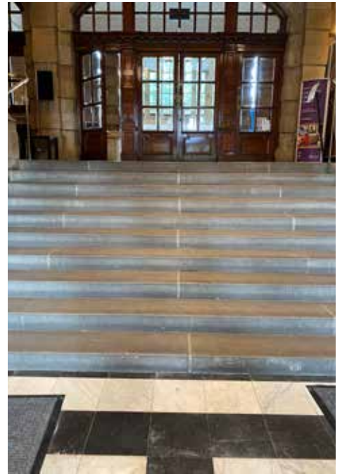
Stairs in the entrance foyer.

Lockers, free to use, large enough for a backpack.