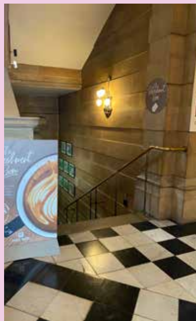
Stairs to go down to the café. There is also a step free route.