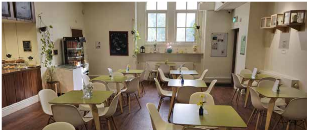
The café, with tables and chairs.

The cafe can be accessed by the door at the side of the building, a short walk from the disabled parking spaces or if you are ok with stairs, it can be accessed from inside the gallery.