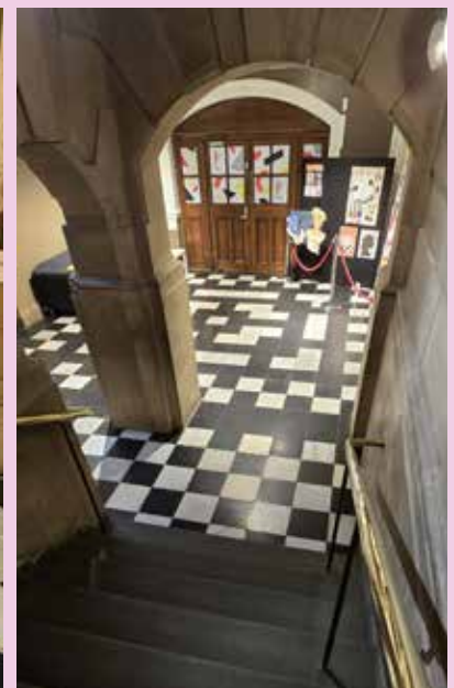
Stairs leading to café entrance.