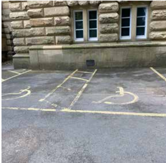
Disabled parking spaces.

Call 01274 431212 on arriving at the barrier and a member of visitor services will open the barrier for you. Please follow the road down towards the gallery and you will see the disabled parking spaces.