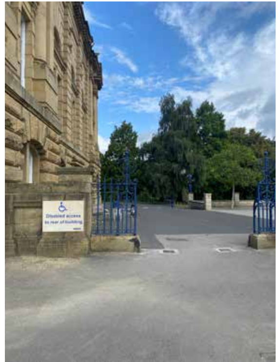
The stone building of Cartwright Hall showing the route to the accessible entrance.

Go through the blue gates and past the café on your left.