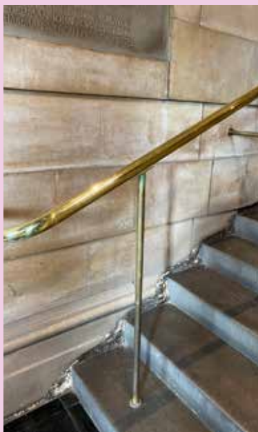
The stone stairs have brass handrails on both sides.

We have stairs inside the gallery to take you to the cafe and the first floor. The stairs have handrails to help you use them.