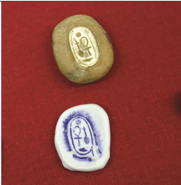
Hieroglyphics on charms at Cliffe Castle Museum